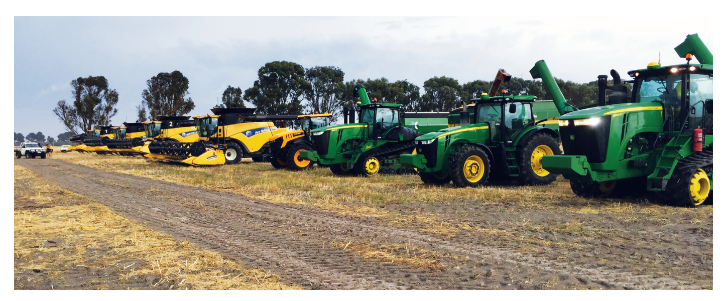
IT TAKES A LOT OF MACHINERY TO PRECISION-CROP 15,000HA AND THERE IS NO DOUBT THE ESPERANCE-BASED YOUNG HILL FARMS BUSINESS HAS A SIZEABLE INVESTMENT IN PLANT AND EQUIPMENT.

what the crop needs. With nitrogen you've got to put it on the line during the season. You're guessing what rain you'll get and how much a crop will yield. You put the nitrogen on and hope that it all turns out the way you want it to."